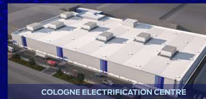
COLOGNE ELECTRIFICATION CENTRE

02 Increasing planned production of electric vehicles in Cologne, Germany, to 1.2 million vehicles over six years, with a total product investment of $2 billion. The investment includes a new battery assembly facility scheduled to start operations in 2024.