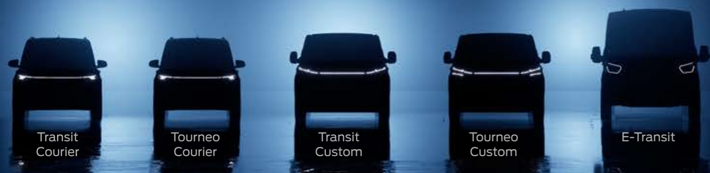
Ford Pro: Five All-Electric Vans by 2024