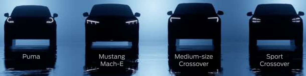
Ford Model e: Four All-Electric Cars by 2024

In addition to the Mustang Mach-E and the E-Transit, three new electric cars and four new electric vans to be built in Europe by 2024, uniquely designed to meet the mobility needs of a modern Europe.