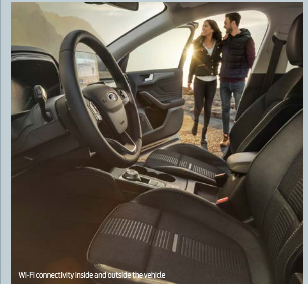
Wi-Fi connectivity inside and outside the vehicle

Multiple vehicles can be added to a FordPass account, and there is no limit to the number of FordPass accounts that can be linked to a vehicle. For families with more than one vehicle, this means each family member can manage every vehicle.