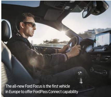
The all-new Ford Focus is the first vehicle in Europe to offer FordPass Connect capability

FordPass Connect onboard modem technology turns the vehicle into a mobile Wi-Fi hotspot and provides access to connected services via the FordPass app